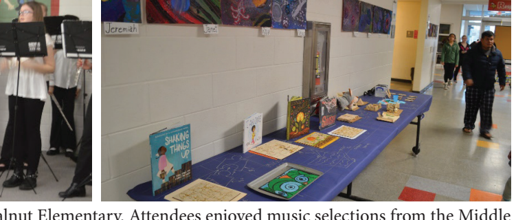
Bangor Creates night took place on March 20, at South Walnut Elementary. Attendees enjoyed music selections from the Middle and High School Jazz Bands, and admired the art projects of students from preschool aged up to high school.