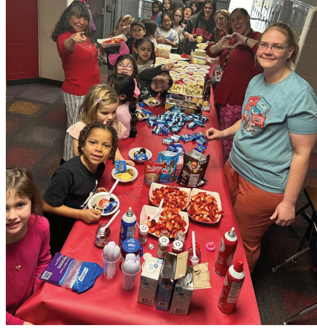
The first grader's enjoyed a sundae bar in celebration for Valentine's Day.