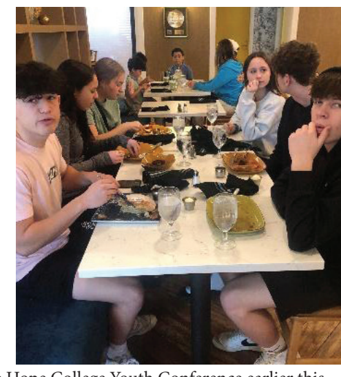
The Hispanic Student Association attended the Hope College Youth Conference earlier this month to learn more about opportunities at the campus.