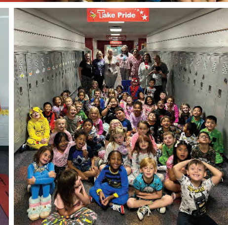
The students and staff dressed up for the Homecoming spirit days from October 2 through 6. Monday was mismatch day, followed by hat day on Tuesday, Pajama Day on Wednesday, Best-dressed day Thursday, and red and white day on Friday.