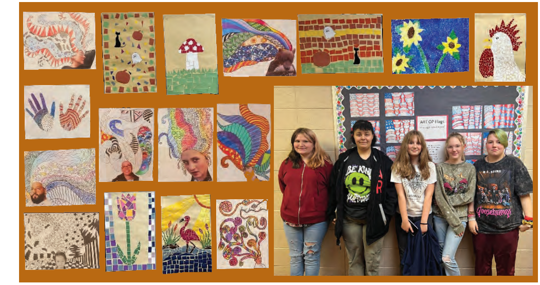
This month Mrs. Rueff's art class has made some wonderful creations, including Optical illusion flags, Zentangle, and mosaic art.