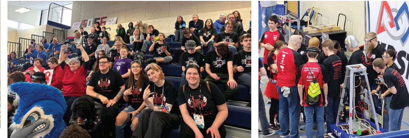
On March 10 and 11 the Bangor High School Robotic team traveled to St. Joseph to compete in their first competition of the school year.