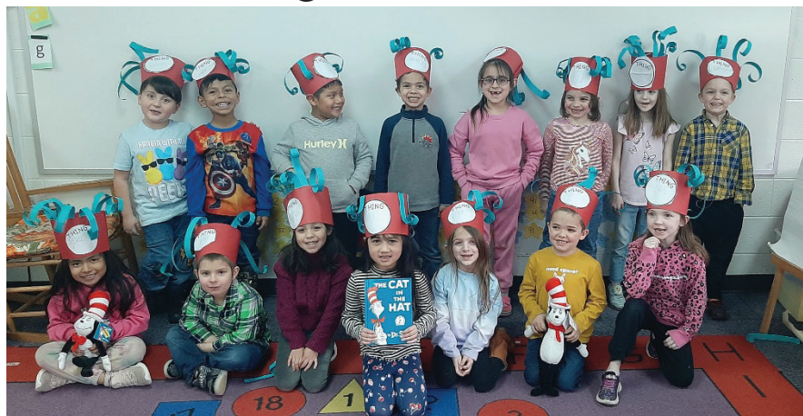
South Walnut celebrated Reading month with several fun activities. Students participated in a family Scavenger Hunt in which the students and their families search around town to find Peter Rabbit at various local places. Those who found all the pictures were then entered into a drawing to win a prize. Other reading month activities included celebrating Dr. Suess's birthday, reading with a flashlight (Flashlight Friday) and more.