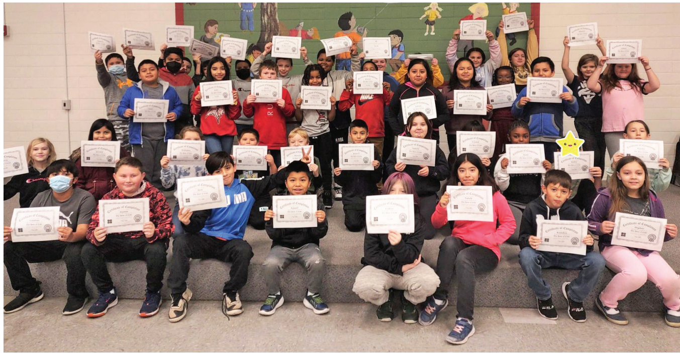
50 South Walnut students in total completed one full hour of learning computer coding!