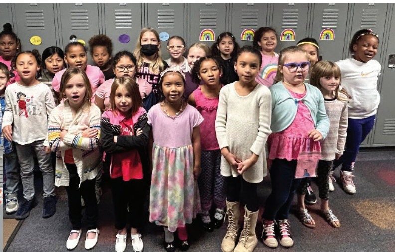
South Walnut students and staff had a blast dressing up for Homecoming!