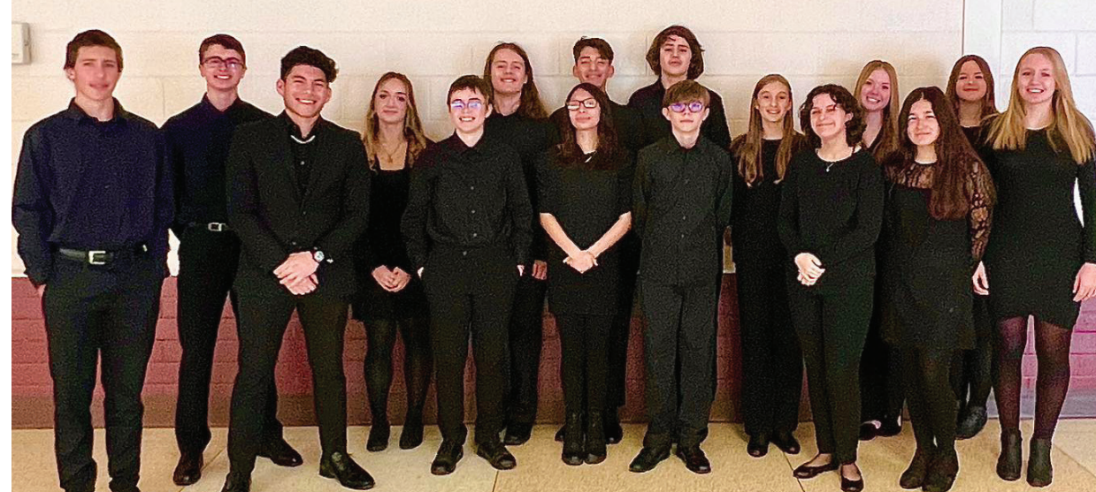
On November 19, Bangor band members performed in the MSBOA District 6 High School All-Star Band Concert.

Every student involved had to audition to perform in this ensemble.