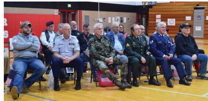
The Veterans enjoy a performance from the BHS band.