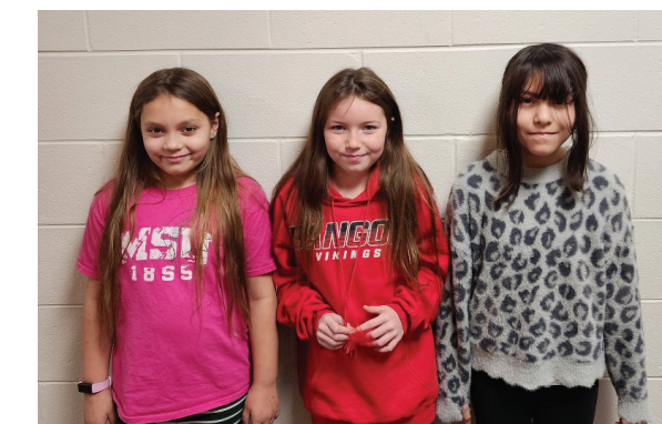
South Walnut Elementary poster contest winners