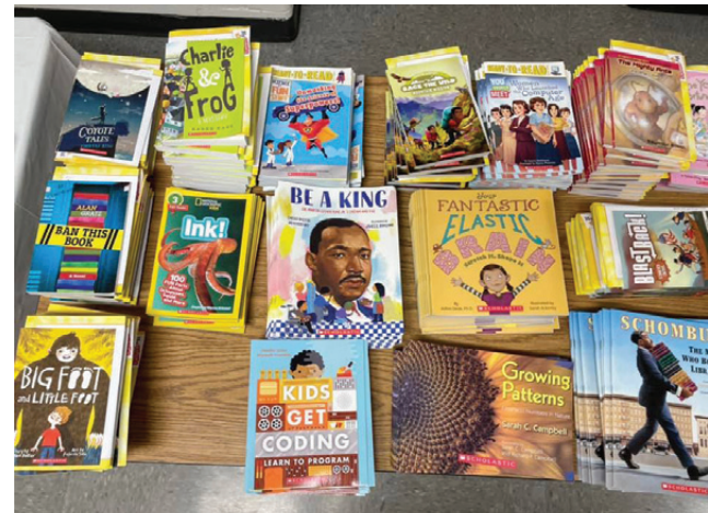
Literacy Night took place on Tuesday, November 16 and had lots of attendees.