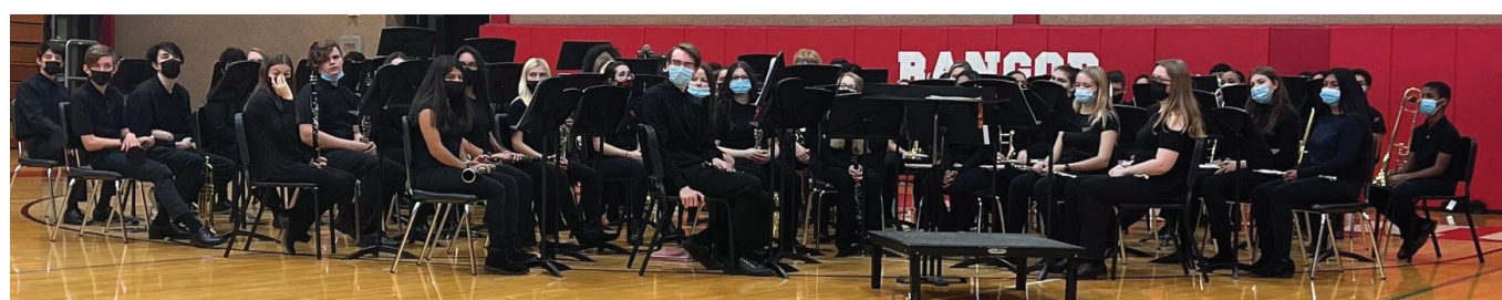
The Bangor High School Band performed an ensemble of military songs also the Bangor High School choir sang "America the Beautiful."