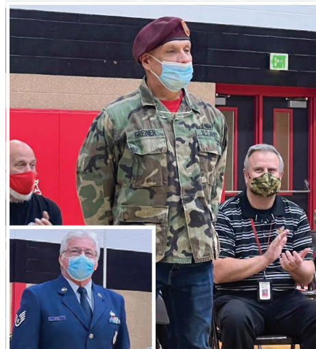
Veterans applauding as their comrade is announced.