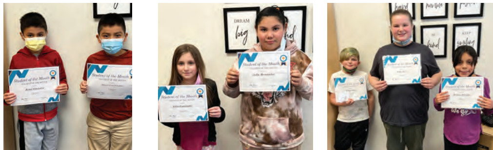
2nd Grade 3rd Grade 4th Grade