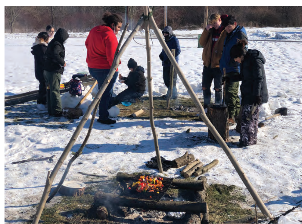
The Wilderness Survival Class braved the cold, thus showing their classmates that they can survive outdoors using only tools from the wild.