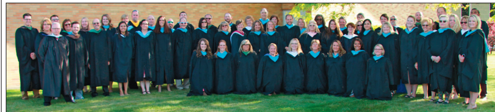
Bangor Public School Teachers

Bangor School Based Health Center is open all summer and is now scheduling appointments for sports physicals, immunizations and other medical and counseling needs. There is no cost to the patients for services. We bill all insurances if you have it and also serve uninsured patients at no cost. Call 269-427-6810 to schedule your appointment.