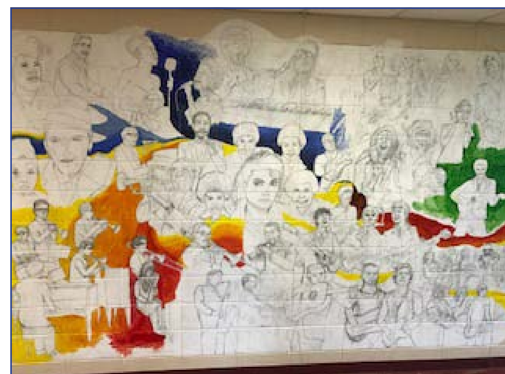
*Art in progress (A sneak peak). A new music mural being completed outside the Band room across from the MS Art room.