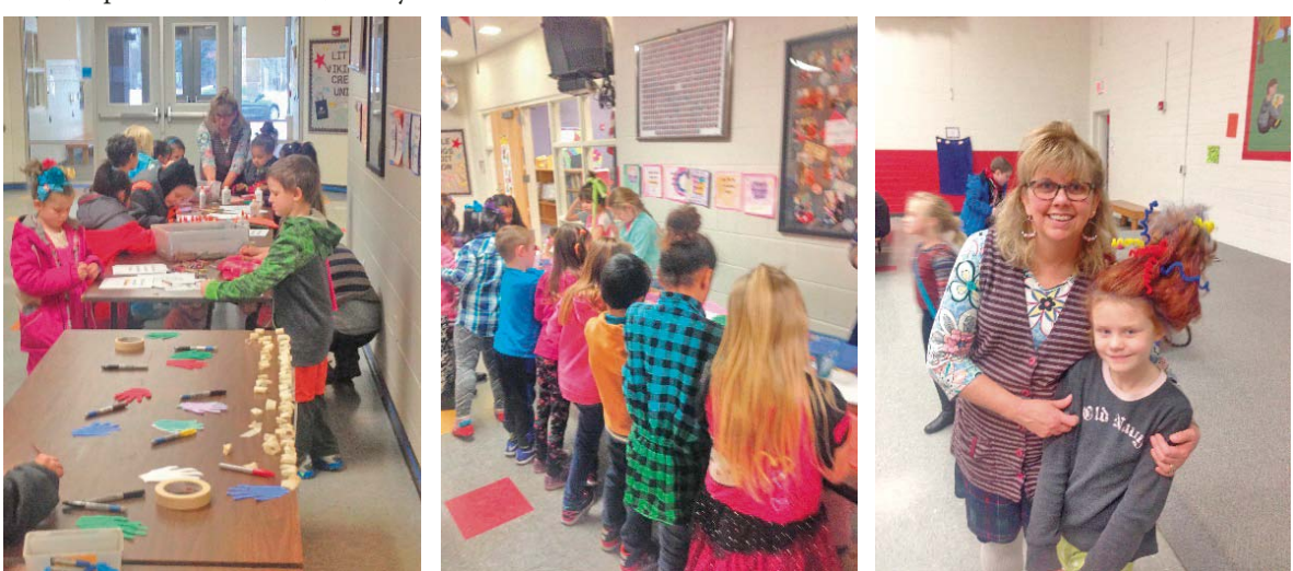
Part of the activities for the week included students having the chance to create a variety of crafts during recess with the help of parent volunteers and crazy hair and clothes.